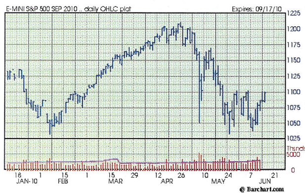
September 2010 E-Mini S&P 500

Since the lows set back in March of 2009, investors have been treated the best stock market rally in history. The E Mini S&P 500 rallied more than 75% off its lows of 676 to reach levels above 1210 in just 13 months. Granted, this came after more than a 50% plunge in the stock market from late 2007 to early 2009. That being said, the real question is, "where are we go from here"? The E-Mini S&P 500 has tested its February '10 lows three separate times over the past 4 weeks (see chart below). Each time the market has recovered nicely by rallying back to the 200-day moving average at 1105. The E-Mini Nasdaq has experienced similar moves off the February '10 lows and is also sitting at its 200-day moving average. So far this year, corporate earnings have exceeded analyst's expectations. Yet, as the European Union's problems unfold, corporate news takes a backseat to the EU's banking crisis. It seemed that the US economy was well on its way to recovering as the market made multi-year highs in late April '10. Most traders were expecting a correction. However, few were expecting a move as sharp and as violent as this. As we progress through June, the EU fears have subsided and the Euro appears to have regained its footing after touching lows against the US Dollar in the 1.17 range.